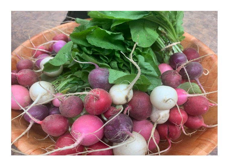
Grateful for Vegetables and Fruits Donation from one of our friends.