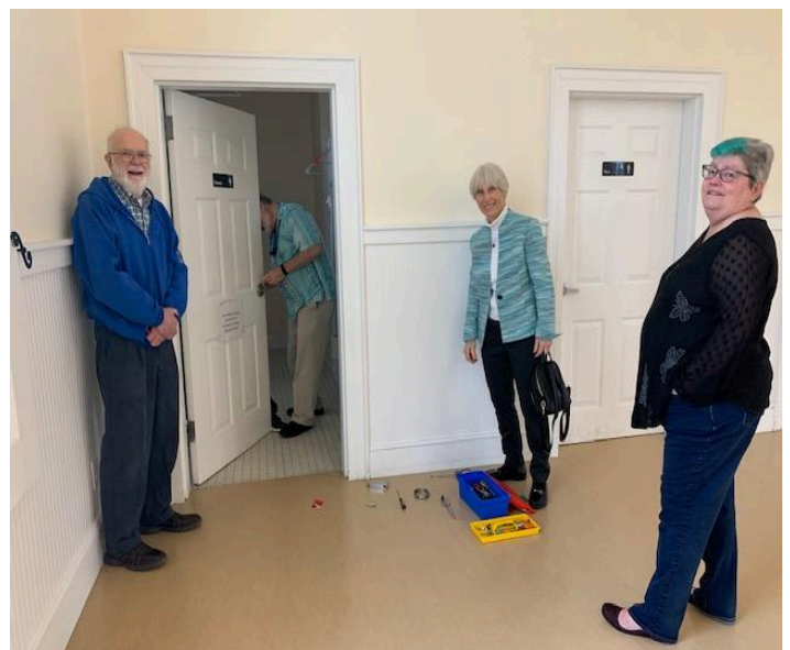
Fixing the door handle that was locked!